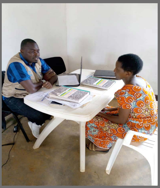
The Legal Aid Forum Project Coordinator providing legal assistance to a refugee in Kiziba Camp in Karongi

After fleeing and leaving everything behind, rights and freedoms can seem like a myth. Due to their vulnerability, refugees and asylum seekers often have most to lose when the system is place is inefficient, and are least able to effectively challenge it. Therefore, educating community leaders in camps about their rights can be impactful and a road to equal rights for all under the law.