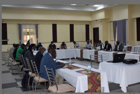
ticipants durign the focus group discussions for the Assessment of the