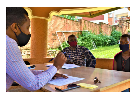
LAF Legal Aid Officer providing legal assistance to beneficiaries at LAF's Office