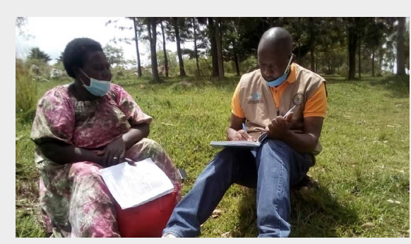
Legal Aid Forum's Paralegal during a consultation with a beneficiary

Paralegals have helped bridge this gap, by providing legal education, mediation, advocacy, as well as legal advice to communities they live. Their first –hand knowledge of the circumstances, challenges and issues faced by the community, allows them to come up with concrete solutions to their beneficiaries' problems.