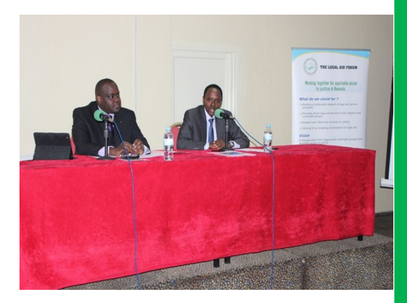
The President of RBA and the Executive Director of LAF opening the

In an effort to improve the provisions of penal code, the Ministry of Justice in collaboration with the Rwanda Law Reform Commission has initiated the process of reviewing the current penal code. Revision processes started in August 2015, and all stakeholders (public or private institutions) have been invited to participate in this process by providing comments and inputs that can be incorporated in the revised penal code. (Turn to p2)