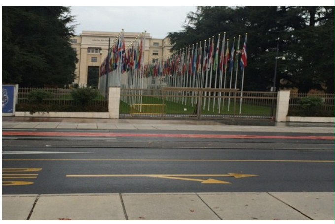
Geneva, Office of the High Commission for Human Rights

The Republic of Rwanda was assessed by its peers for the first time in 2011 and a number of recommendations were given to the government. During the first UPR review process Rwanda Human Rights NGOs formed a coalition that engaged civil society organisations and independent experts across the country to ensure their active participation in the UPR process. The sustained nationwide UPR consultation and intensive research conducted by the coalition resulted in a first NGO coalition shadow report submitted to the High Commission for Human rights in June 2010, to serve as a source of information while reviewing Rwanda in June 2011.