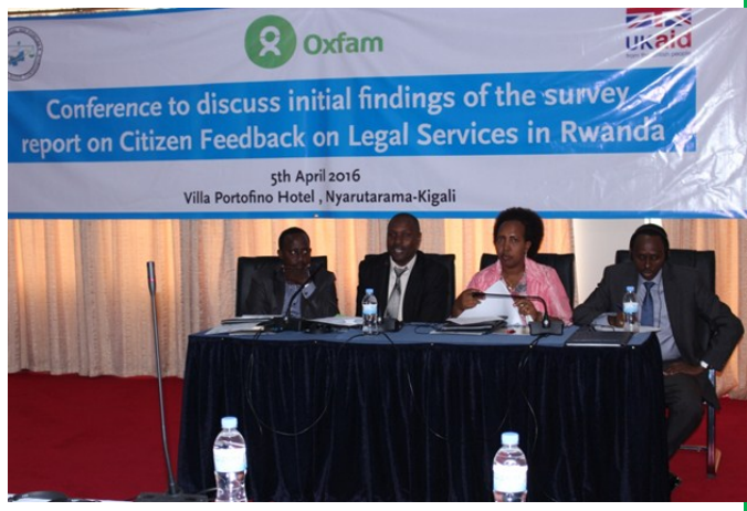
The President of LAF explaining what LAF expects from the collected information

On the settlement of disputes out of court vis-à-vis the formal court system: citizens are generally satisfied with the legal aid services provided by non-state legal aid providers, MAJ, Abunzi and local authorities;