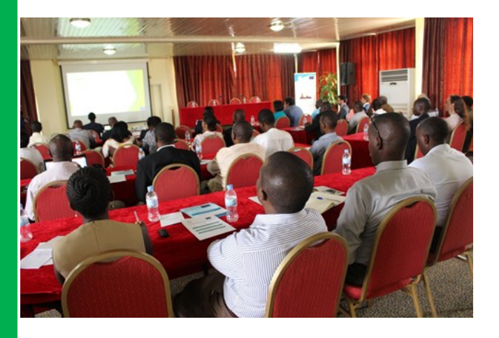
Participants following a presentation on the new project

This new project aims at raising community awareness of pre-trail, trail, and post-trail rights and procedures; Strengthening the capacity of and raising awareness of criminal justice actors on the use of alternative measures to imprisonment; Providing direct legal services to indigents and vulnerable groups; Promoting prisoners' rights by advocating on improved detention conditions.