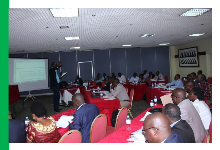
Participants to the Workshop following a presentation

As active members of the justice sector in Rwanda, the Legal Aid Forum and the Rwanda Bar Association are engaged a lot in access to justice and human rights initiatives such as policy and legal research that contribute to relevant reforms in the sector. The ongoing review process of the penal code provides a great opportunity for LAF and RBA to continue their work and contribute to this important activity by providing its inputs regarding the (new) penal code.