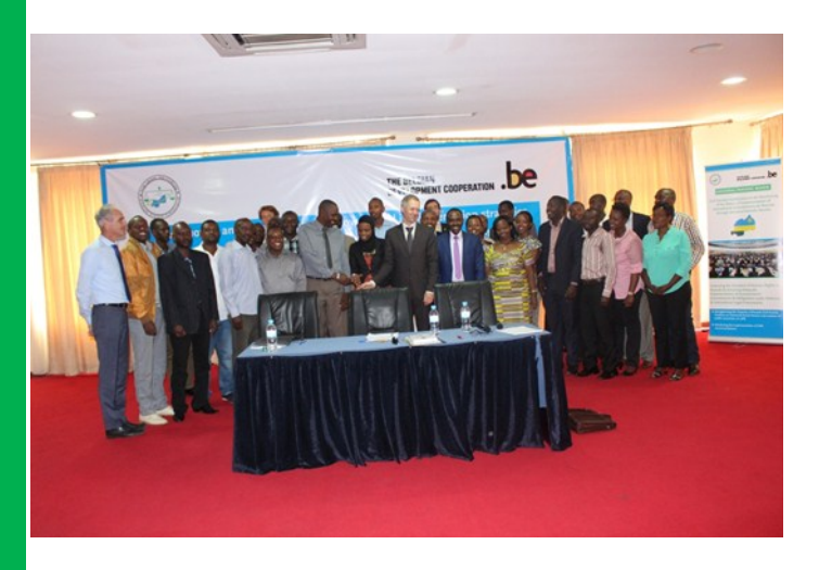
Participants to the Workshop in a group photo

Workshop to analyse and propose follow-up and implementation strategies of UPR recommendations given to Rwanda during the twenty-third session of Human Rights Council