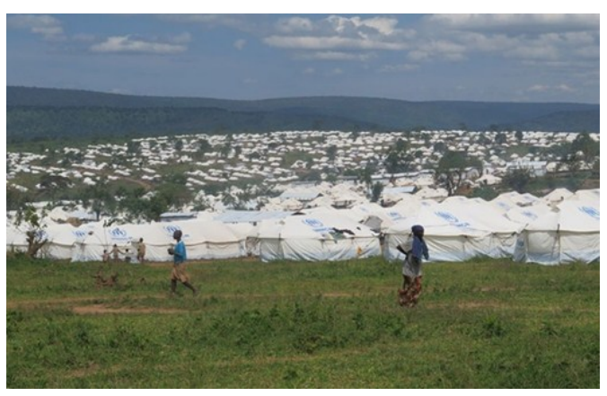
One of the camps for refugees in Rwanda

This increased number directly goes with increased needs of these refugees including legal assistance and representation. The Legal Aid Forum, as a specialized NGO in providing legal services and advocating for access to justice is handling legal related issues involving Persons of Concern.