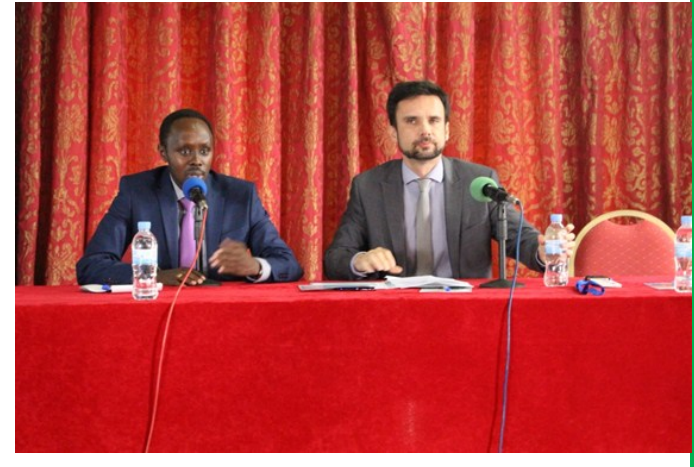
The Executive Director of LAF with EU representative launching the Project

A project entitled "Improving the performance of criminal justice system in Rwanda through the provision of legal aid, raising awareness and Human Rights education" was launched during an event organised On 3 March 2016, at Novotel Umubano Hotel, in Kigali.