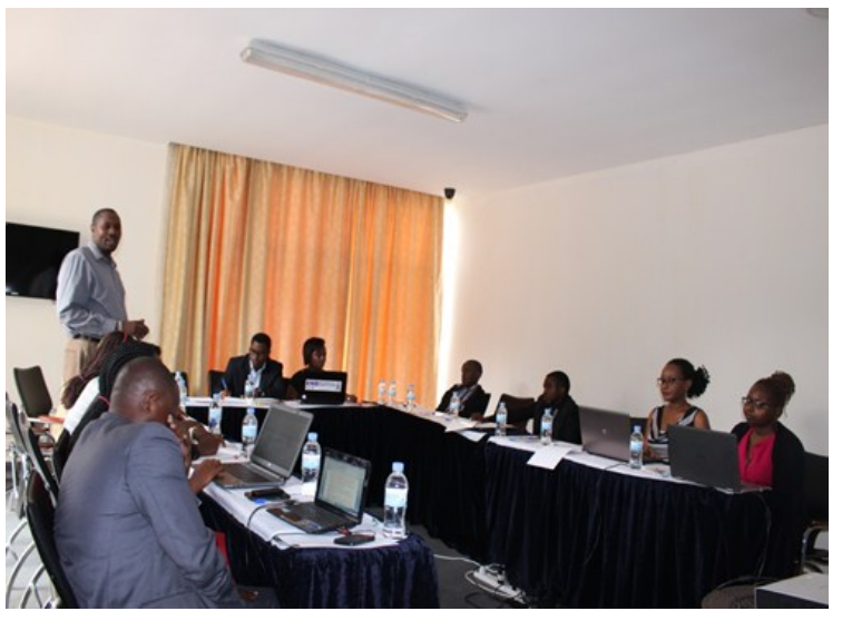
The President of the board opening the meeting

The Legal Aid Forum is currently implementing a project entitled "Citizen Monitoring of the Justice Sector in Rwanda" which is designed to assess the current framework of interaction between justice institutions and citizens using feedback collected from citizens through ICT, and suggest possible actions for improvement.