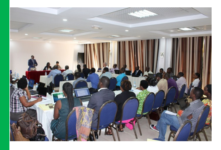
Partners validating the Questionnaire on 14 August 2015

The questionnaire used to collect data for this study was developed with representatives of the 10 implementing LAF members with whom LAF is partnered on the project. LAF has sought stakeholders input from state institutions, civil society organizations, and NGOs at every critical stage of the project. On 14/08/2015 at the Grand Legacy Hotel, our partners assisted with the validation of the questionnaire to be used.